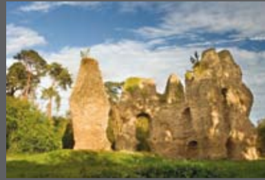
St John's Castle

Head towards Basingstoke from the village centre and after railway bridge take a right down Morris Street. At the junction with Old School Road, turn right and then left (signposted Fosters Business Park). After 10m take footpath to left and continue via track past Basingstoke Country Hotel. Cross A30 and walk down Heather Row, over motorway and immediately left onto footpath and through trees to gravel path to your right. After 250m follow path to right, continue straight for 200m and bear left. At the next path crossroads, take second turning (11 o'clock). Cross path through kissing gates and eventually into a field. Take path to left after 150m signposted 'to the tunnel'. At the road, turn right. The Fox and Goose pub is ahead of you. Turn down Deptford Lane and after 10m, take path on left and join canal towpath. Continue along canal passing King John's Castle.