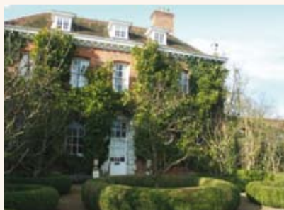
West Green House

On leaving the house, continue on path through an iron gate for about 500m. Cross road, take the track past Borough Court House. At the house entrance, turn right through gates across the fields and across the bridge. Turn